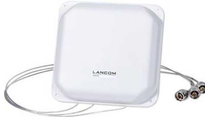
WLAN Antenne Outdoor ON-T60ag WLAN Antenne Outdoor ON-T90ag