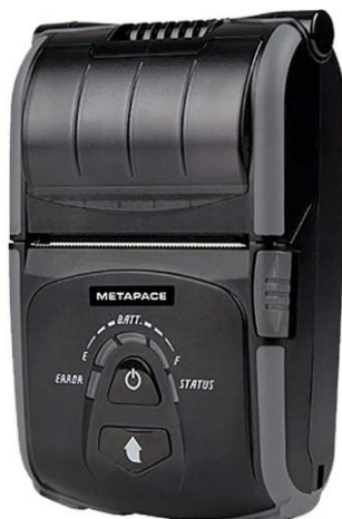
SPP-R200III / Metapace M-20i