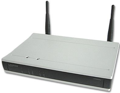
WLAN Access Point Professional