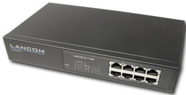
Prices Power over Ethernet Switch