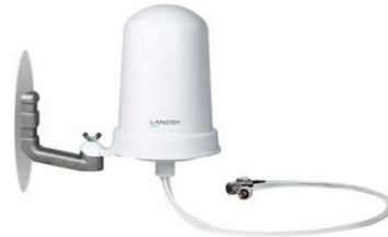
WLAN Antenne Outdoor ON-T360ag