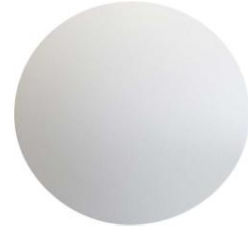
WLAN Antenne Indoor IN-T180ag