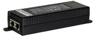
POE Injector GE PoE+