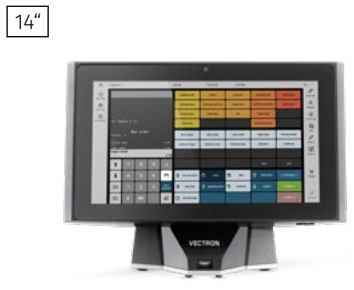
POS Touch 14 Wide Modern touch screen POS system with top functions