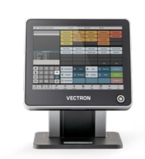
POS Touch 15 II The touch screen system with style