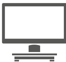
POS 7 Stand variant

The system box can be easily separated from the rest of the hardware and can thus be mounted under the counter, for example. This facilitates the handling of cables and provides the option for pole or wall mounting.