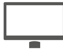
VESA variant of POS 7 for under counter mounting